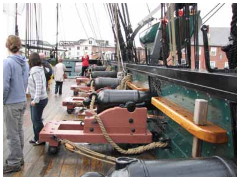
Deck Gun Battery