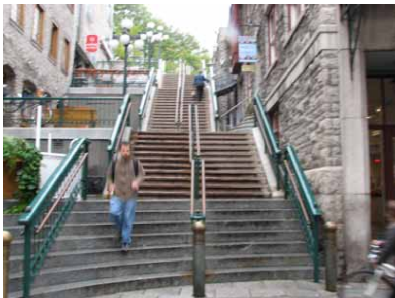
The hard way