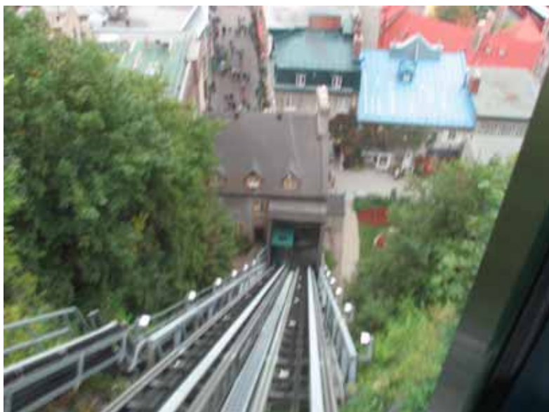
The easy way

There were 2 churches I wanted to visit, Notre Dame des Victoires in the old city, and the Basilica up on the plateau. When I got to the church in the old city, I found it did not open for about a half hour, so I took the funicular up to the plateau. There are 2 ways to get up and down, the funicular, or a series of steps called "Breakneck Stairs" for obvious reasons