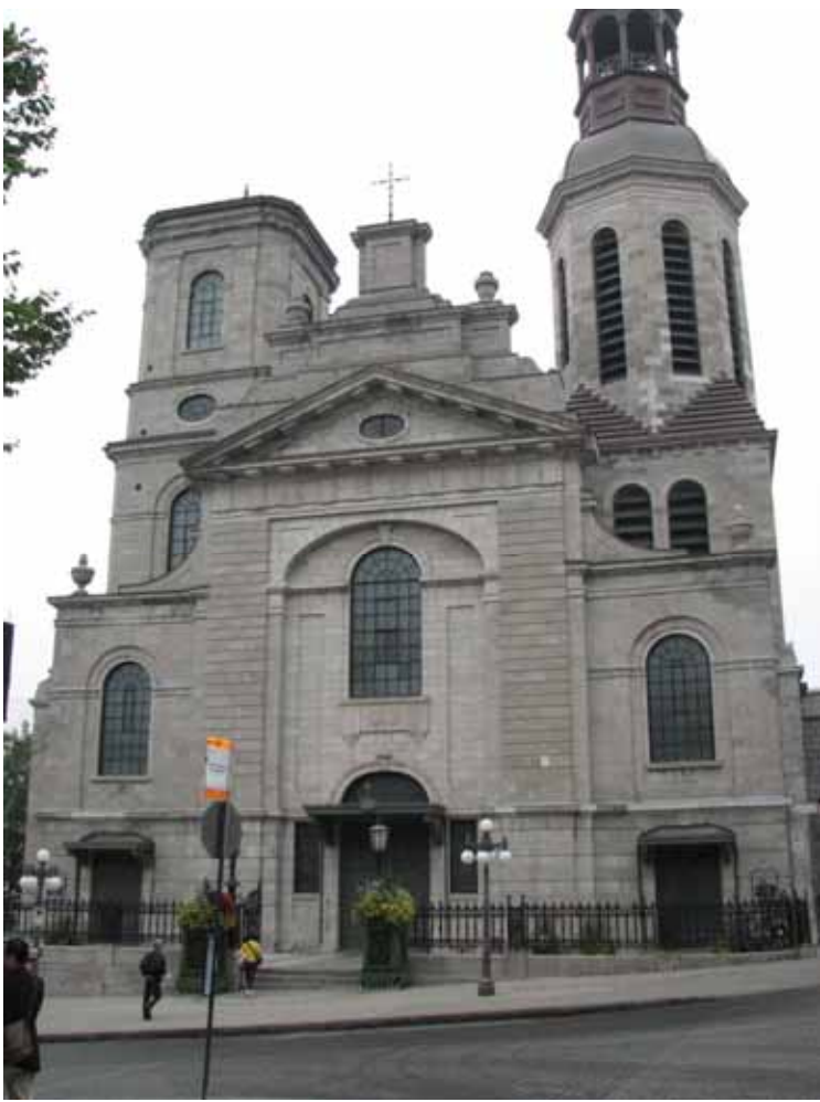
Basilica of Quebec City