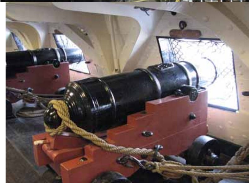
Main Gun Battery