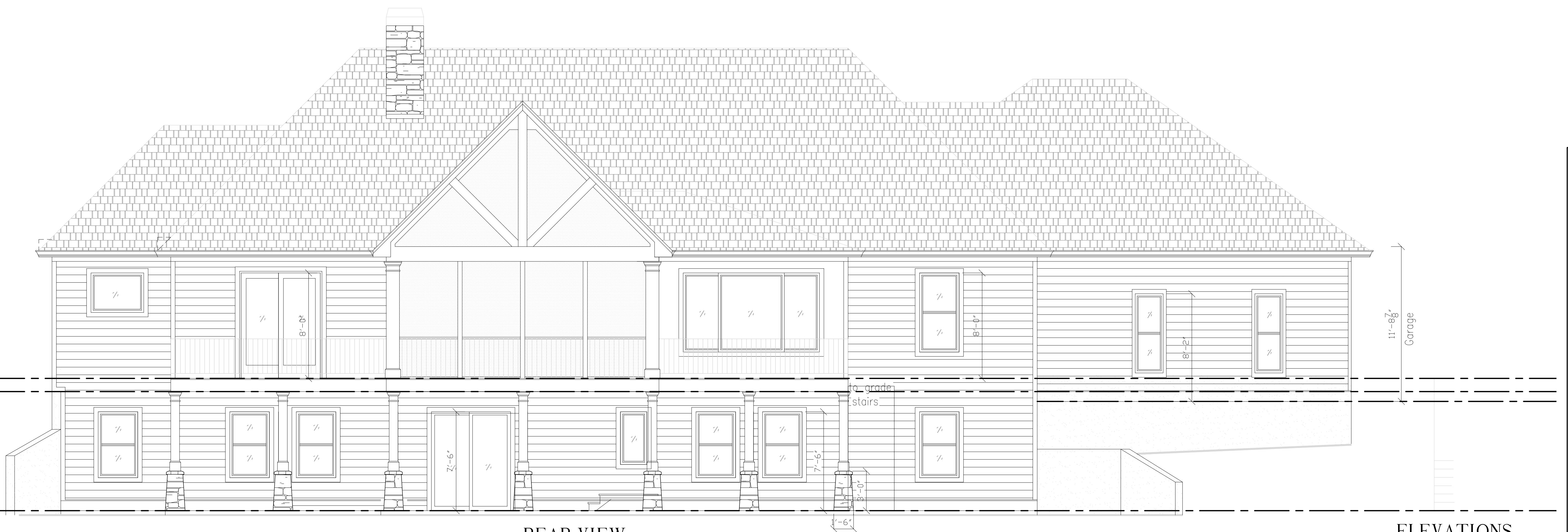
ELEVATIONS SCALE: 1/4"=1'-0"

revision date revision November 13, 2023 revised by revised by LGB project no 1123