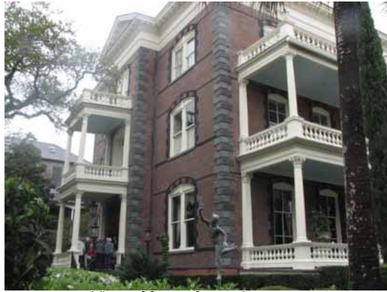
View of front of mansion

The gardens were beautiful, with the Azaleas blooming, and across the street was a home given to the original owner's daughter. Kathy fell in love with the two porches!