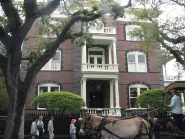
Front of mansion Side

Unfortunately, we were not allowed to take pictures inside, I assume to protect the artwork and fixtures.